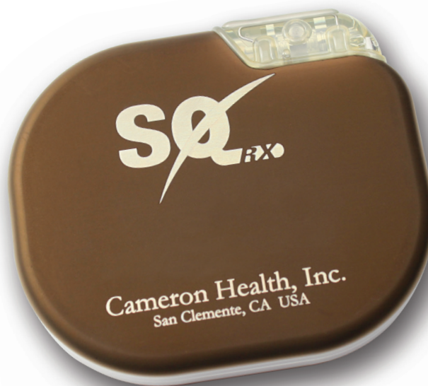
ACTUAL SIZE (When printed at 100%)

World's first and only completely subcutaneous ICD