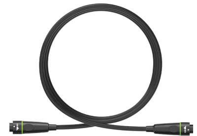
INTELLANAV STABLEPOINT Catheter Cable

*For customers employing the MAESTRO 4000 Controllor