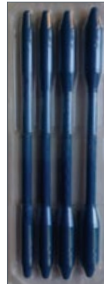
Dilators (left) available in sizes (9–16 mm)

Disposable Dilators are also available and allow for dilating and measuring in one step.