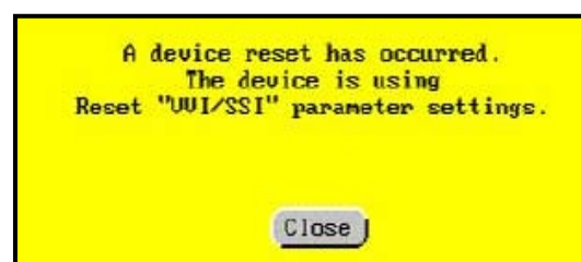
Figure 3. Pacemaker reset message.