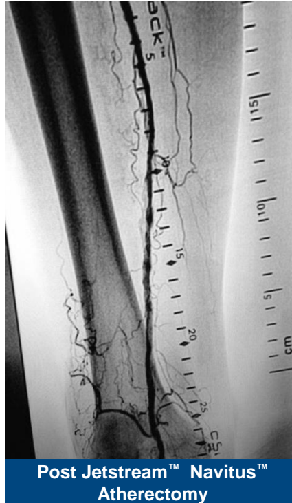
Post Jetstream™ Navitus™ Atherectomy