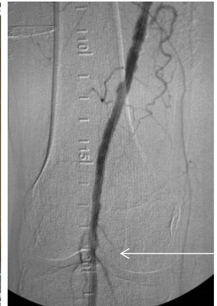
Post-Jetstream Navitus L Atherectomy Angiogram

45.3% Plaque Burden, Minimum Luminal Diameter 6.8mm