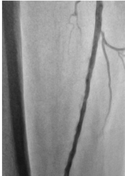
Post Jetstream™ Navitus™ L Atherectomy

2 passes Blades Down, 2 passes Blades Up