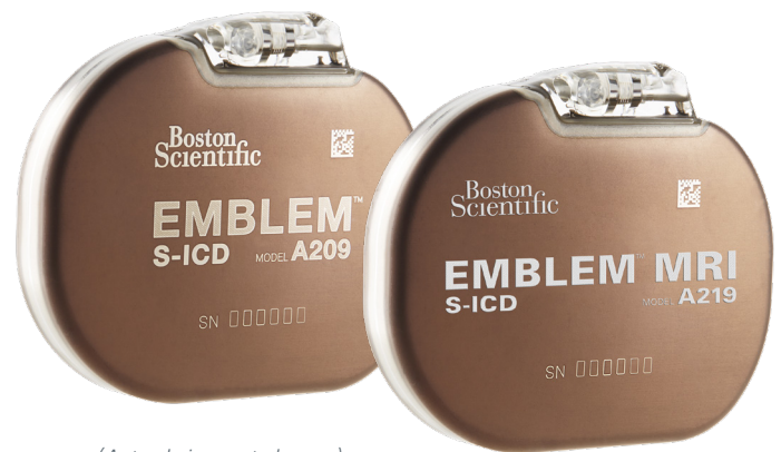
(Actual size not shown)