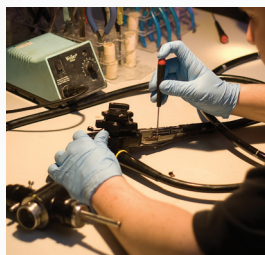
Scope Repair & Certified Pre-owned Equipment