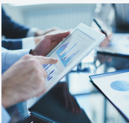
GI Lab Optimization

For more than three decades, Boston Scientific has partnered with leading healthcare providers to help improve patient outcomes through minimally invasive devices. Today, as healthcare provider needs change, we continue to work collaboratively with our customers to help optimize patient care and manage costs through our products, services and solutions.