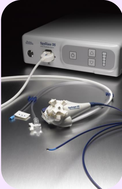
Boston Scientific SpyGlass DS II Direct Visualization System M00546650