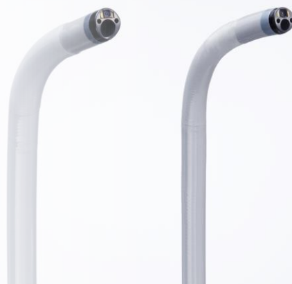
Scivita Medical Single-use Video Cholangioscopes