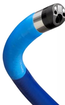
SpyGlass™ DS II