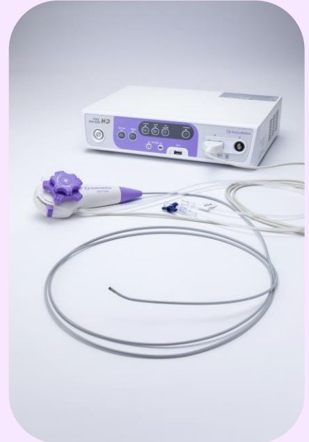
Scivita Medical Endoscopic Image Processing Device HDVS-S200D

Full portfolio of accessories compatible with 1.2mm working channel to assist in cholangioscopy procedures