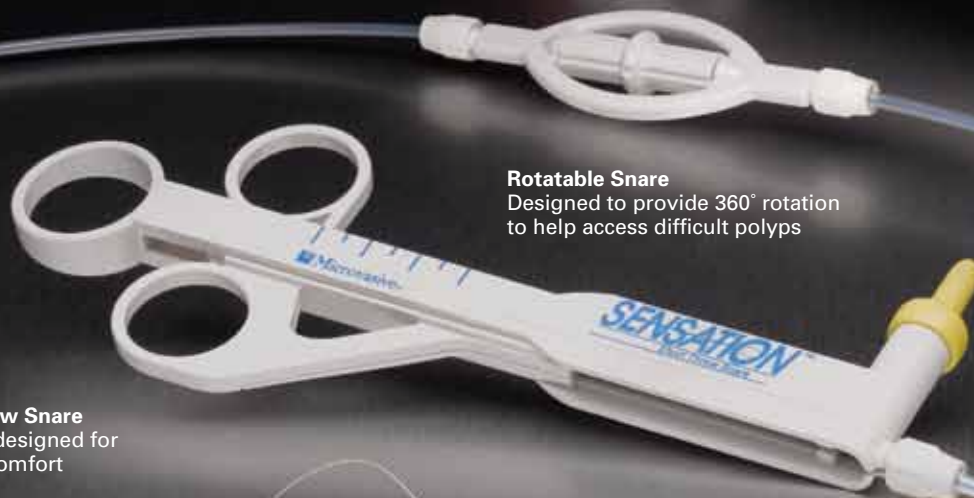
Sensation™ Short Throw Snare Short throw handle is designed for nurse and technician comfort