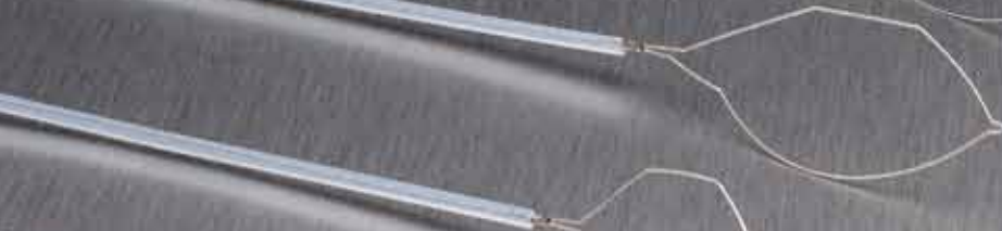
Captivator™ Snare Offers a variety of snare loop configurations to accommodate a wide range of therapeutic functions