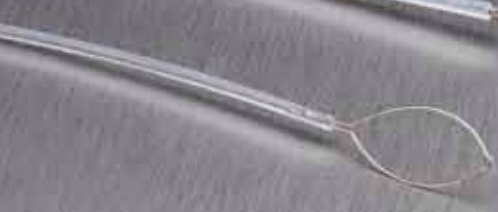
Profile™ Pediatric Snare Engineered to fit through most 2.0mm pediatric working channels