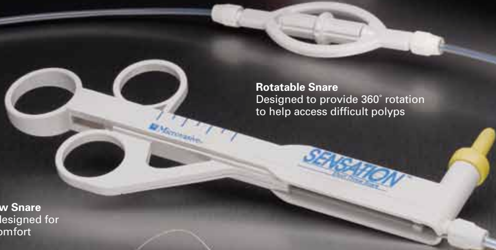
Sensation™ Short Throw Snare Short throw handle is designed for nurse and technician comfort