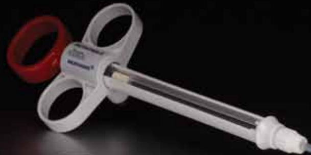
Rotatable Snare Designed to provide 360° rotation to help access difficult polyps

Boston Scientific Advancing science for life™