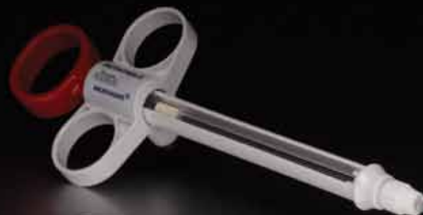
Rotatable Snare Designed to provide 360° rotation to help access difficult polyps

Boston Scientific Advancing science for life™