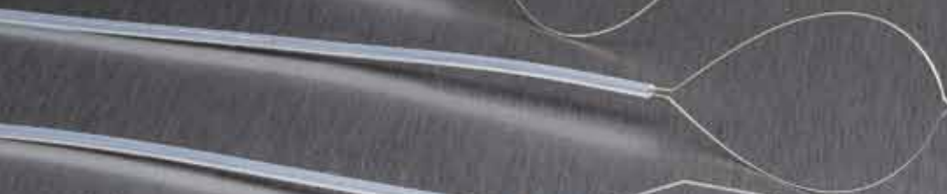
Captiflex™ Snare Incorporates a braided wire design engineered to produce a flexible snare