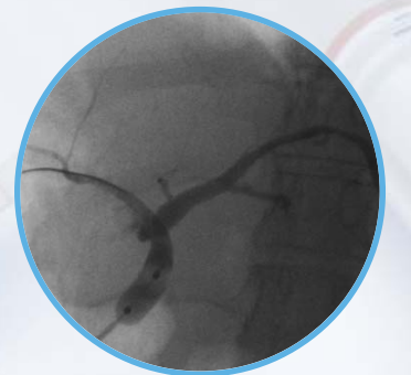
Dilation of a stricture with the Hurricane Dilatation Balloon