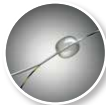
RX Biliary System Procedural Efficiency and Control