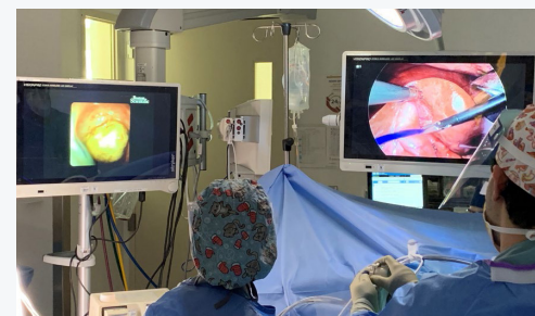
Right: Laparoscopic view on right with SpyGlass Discover entering cystic duct. Left: Spy Discover direct image of stone in the CBD.

In view of continuation of symptoms with leukocytosis despite conservative management, and after a lengthy discussion, the patient was taken to the operating room for laparoscopic cholecystectomy. During the procedure, trans-cystic exploration of the common bile duct (CBDE) was performed using the SpyGlass™ Discover Digital Catheter. After direct visualization of the dilated CBD with two stones at the level of the sphincter of Oddi, a basket was used to remove the stones under direct visualization. After confirming the duct was clear, an EndoLoop was placed over the cystic duct stump. The operation took 150 minutes with EBL of 10 cc.