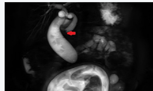
MRCP demonstrated distended gallbladder with multiple stones, and dilated CBD. Red arrow pointing to filling defects in the CBD.

A 30-year-old female in a second trimester of her pregnancy presented with symptoms and signs consistent with acute cholecystitis. Due to a deranged liver function test and a dilated common bile duct (CBD), from an ultrasound, a MRCP was obtained which revealed choledocholithiasis. A subsequent ERCP was aborted after a few stone extraction attempts. This was done to mainly minimize radiation exposure of the fetus, and a plastic stent was placed. However, the patient continued to be symptomatic after the procedure.