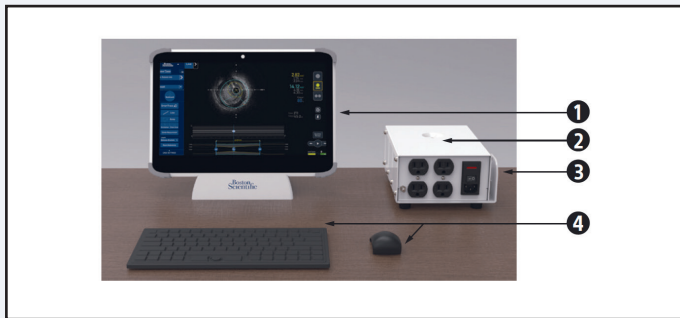
1 Tablet in Desktop Docking Station, 2 System Identification Label, 3 Isolation Station power button, 4 Keyboard and Mouse are installed in the control room adjacent to the procedure room.

The Integrated System is customized for the clinical environment where it is used. In a typical integrated configuration, the system components, are shown.