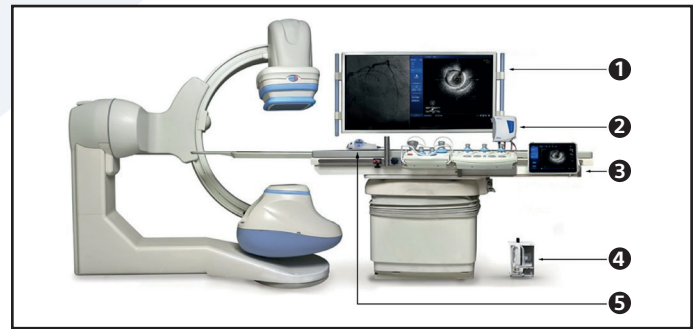
1 Secondary Display, 2 FFR Link, 3 Tableside Control, 4 Acquisition Processor located either behind the monitor or on the floor, 5 Motordrive until.

Tableside Control, compatible resolution of 1920 px X 1080 px, is a rail-mounted touchscreen display that allows for interaction with the system at the bedside to improve the overall procedural workflow.