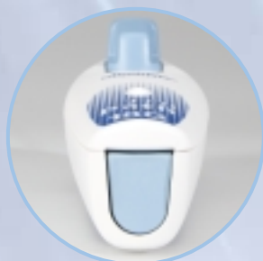
Rear Firing Button