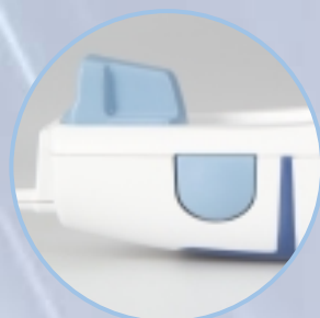
Side Firing Button