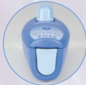
Rear Firing Button