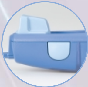
Side Firing Button