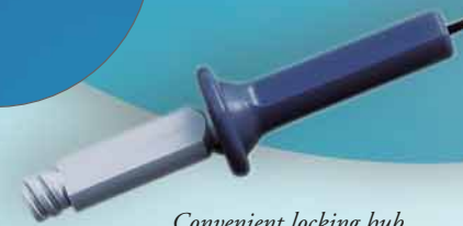
Convenient locking hub for procedural efficiency