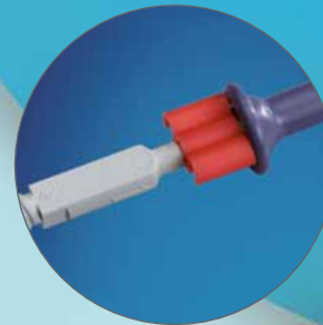
Packaged with new Red Spacer Clip which is designed to keep the needle inside the catheter until used