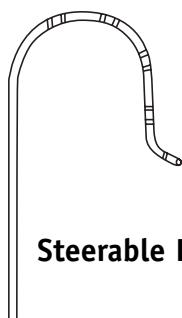
Steerable E (HIS) Curve