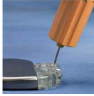
Figure 1. Wrench tilted 20° to 30° from perpendicular position.

A. From a perpendicular position, tilt the wrench 20° - 30° from the vertical center axis of the screw (Figure 1).