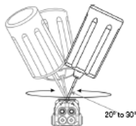
Side view of hex wrench during rotation.