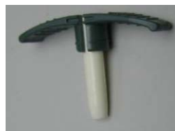
Figure 1. 11 Fr TVI tool.