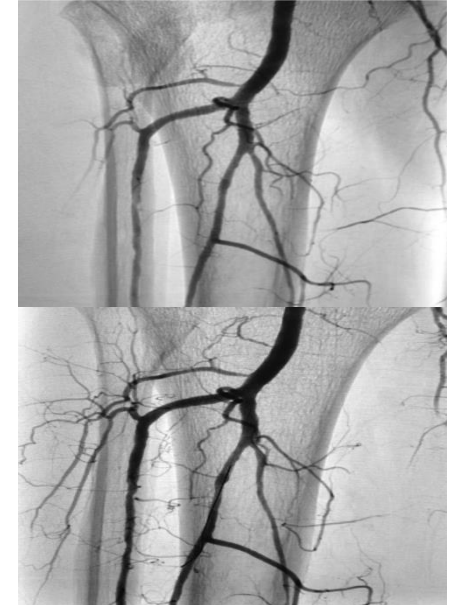
Pre and Post tibial flow

Results from case studies are not necessarily predictive of results in other cases. Results in other cases may vary.