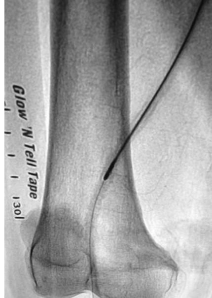
Jetstream™ Navitus™ Atherectomy

Popliteal lesion Patient was a claudicant