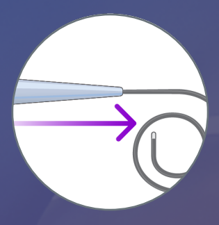
Secure effortless delivery

Facilitate advancement across septum with a sleek dilator-to-sheath profile