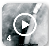
Final Result in LAD/D2