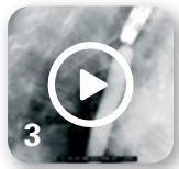
Left Main, Left Circumflex & Left Anterior Descending Disease