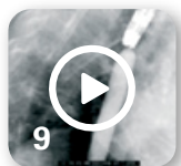
Final Result in Left Main and Left Circumflex