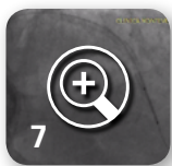
7 Implantation of distal Promus PREMIER™ 2.5 x 12 DES with FFR value of 0.84 (not pictured)