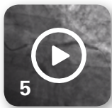
5 Inflation of Promus PREMIER™ 2.5 x 38 DES