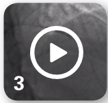
3 Pre dilation with semi compliant balloon