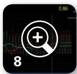
8 Final angio