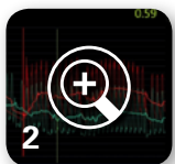
FFR with adenosine