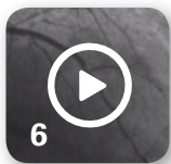
6 Distal edge dissection and FFR value of 0.73