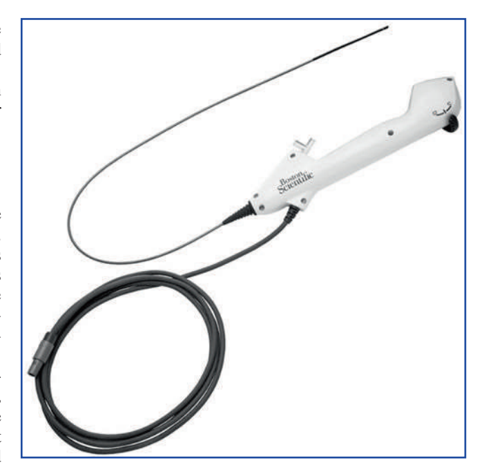
FIG. 1. LithoVue: single-use digital flexible ureteroscope.

performed using GraphPad Prism version 6.00 for Mac OS X, GraphPad Software.