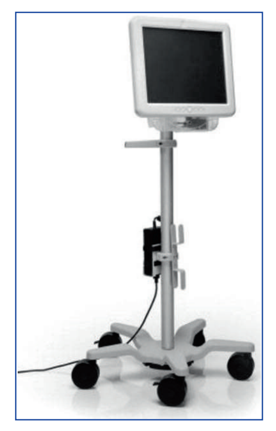
FIG. 2. LithoVue's monitor.

the level of sacroiliac joint. The reusable digital ureteroscope was unable to reach one calix of the lower pole (Renal unit 2) and one calix of the upper pole (Renal unit 3) without UAS placement, probably because of the large diameter of the ureteroscope and the reduced shaft rigidity. Lower pole access with baskets and laser fibers was possible for each ureteroscope after UAS placement (Table 2). No statistically significant differences were detected in angle deflection