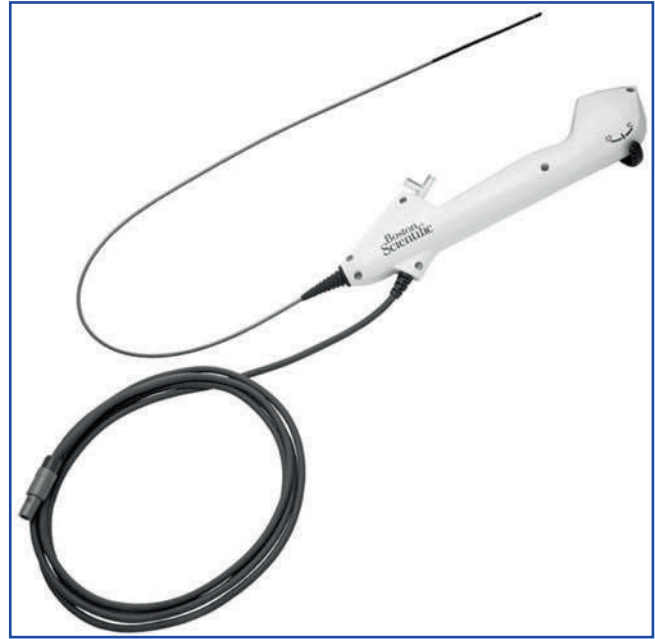
FIG. 1. LithoVue: single-use digital flexible ureteroscope.

Data are presented as mean and standard deviation. Between-groups comparisons were made using Kruskal–Wallis test. A p value <0.05 was considered significant. Statistical analyses were