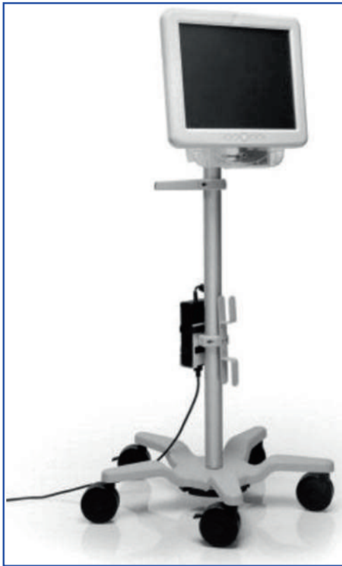
FIG. 2. LithoVue's monitor.

the level of sacroiliac joint. The reusable digital ureteroscope was unable to reach one calix of the lower pole (Renal unit 2) and one calix of the upper pole (Renal unit 3) without UAS placement, probably because of the large diameter of the ureteroscope and the reduced shaft rigidity. Lower pole access with baskets and laser fibers was possible for each ureteroscope after UAS placement (Table 2). No statistically significant differences were detected in angle deflection